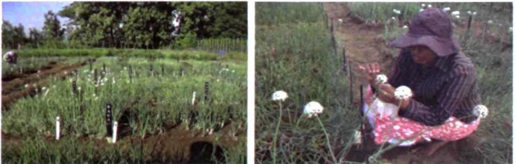
Plate 3: Multiplication of F_1 generation and hybridization through emasculation.

After a long gap, cluster onion research at FCRDI, Mahailuppallama was reinitiated and 7 seed setting cluster onion lines in yala 2009 and 2010 were evaluated. Those lines were evaluated with Vethalam during yala 2011 and two lines gave higher yields over Vethalam. Evaluation of cluster onion line MICLO.09-01 for true seed production was carried out in maha 2012/13 and yala 2013 at FCRDI. MICLO 09-01 reached to 50% flowering within 69-70 DAP irrespective of vernalization. Flowering of Vethalam depended on vernalization and 50% flowering completed within 52DAP which was 26 days earlier than other lines. It was concluded that MICLO 09-01 produced higher true seed yield than Vethalam.