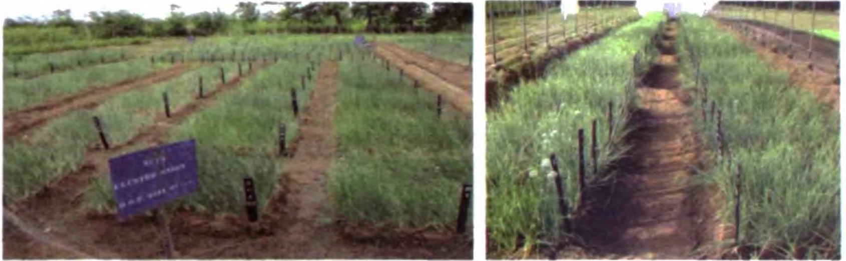
Plate 2: Testing of short age lines under NCVT (left) and selected flowering lines tested under MYT (right).

mature. Philippine variety recorded lower yield but matured in 70 DAP. Thailand varieties produced large size sets and Local Red and Vethalam recorded more storage losses (FCRDI, 1967-2014).