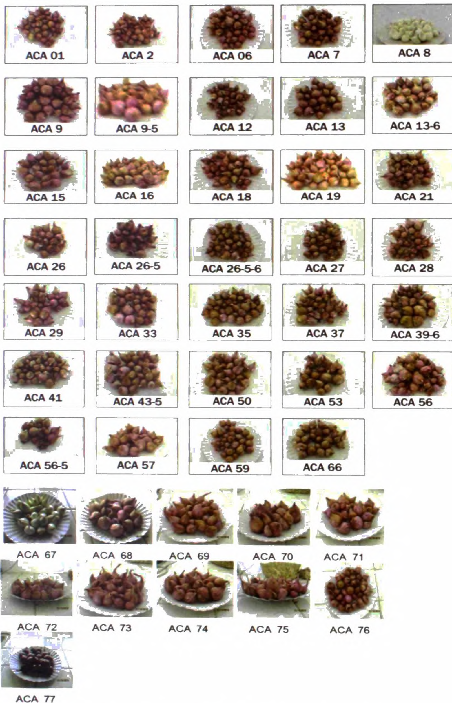
Plate 1: Variation in germplasm available at RARDC, Aralaganwila.