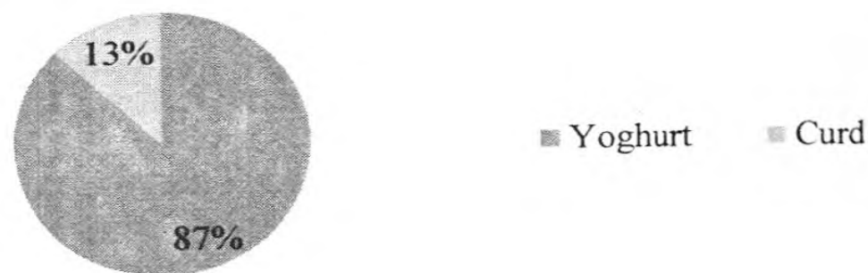
Figure 2: Distribution of most purchasing fermented dairy product category