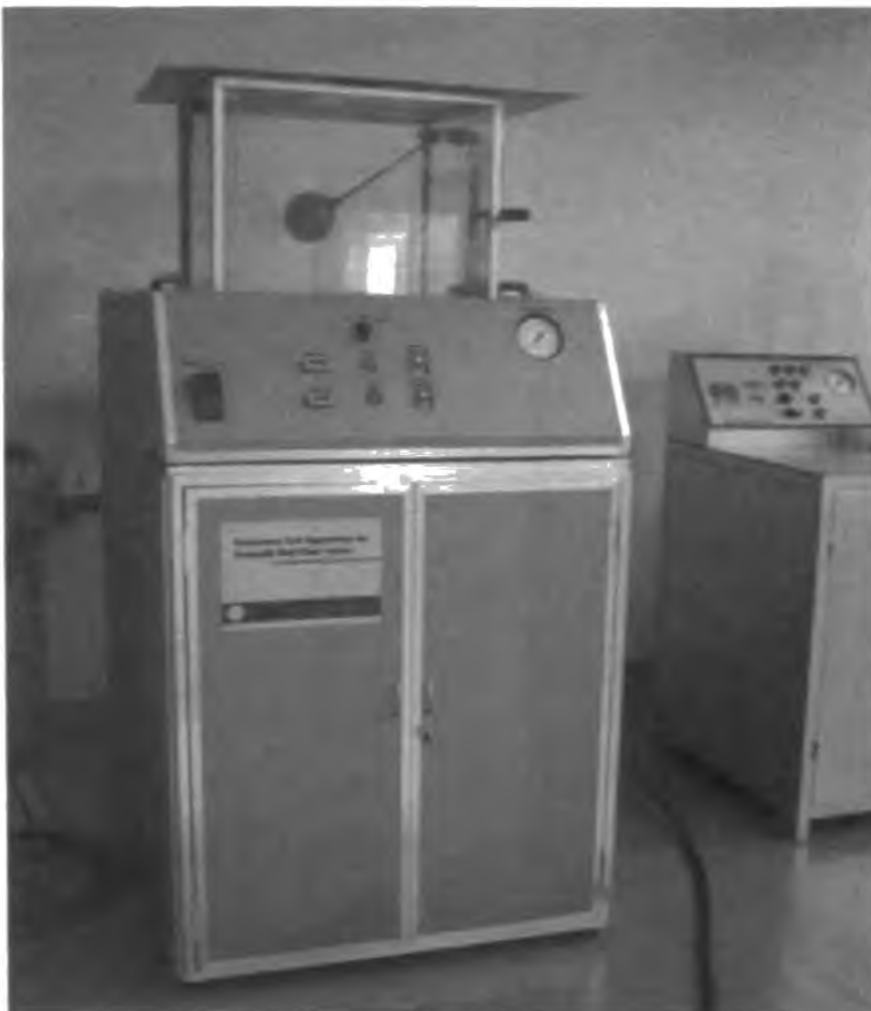
Figure 01: Float control valve test apparatus

This apparatus has been designed to make cyclic on/off operation occurred by responding variation of water level and run the system for set number of cycles. At the end of the test the valve will be tested for its current performance level.