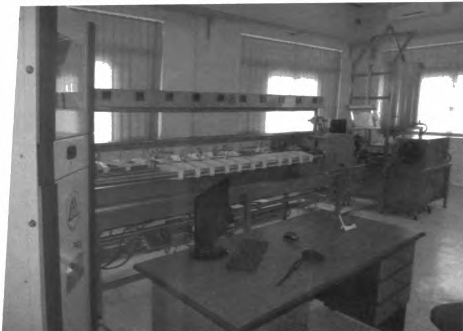
Figure 04: Water meter intrinsic error test apparatus