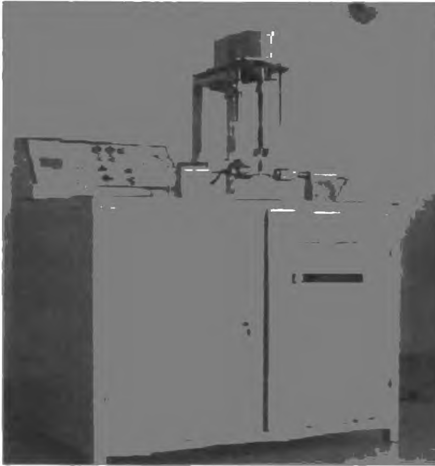
Figure 02: Stop cock test apparatus

This apparatus has been designed to make cyclic on/off operation by turning the stem of the valve while pumping water flow through the valve and run the system for set number of cycles. At the end of the test the valve will be tested for its current performance level.