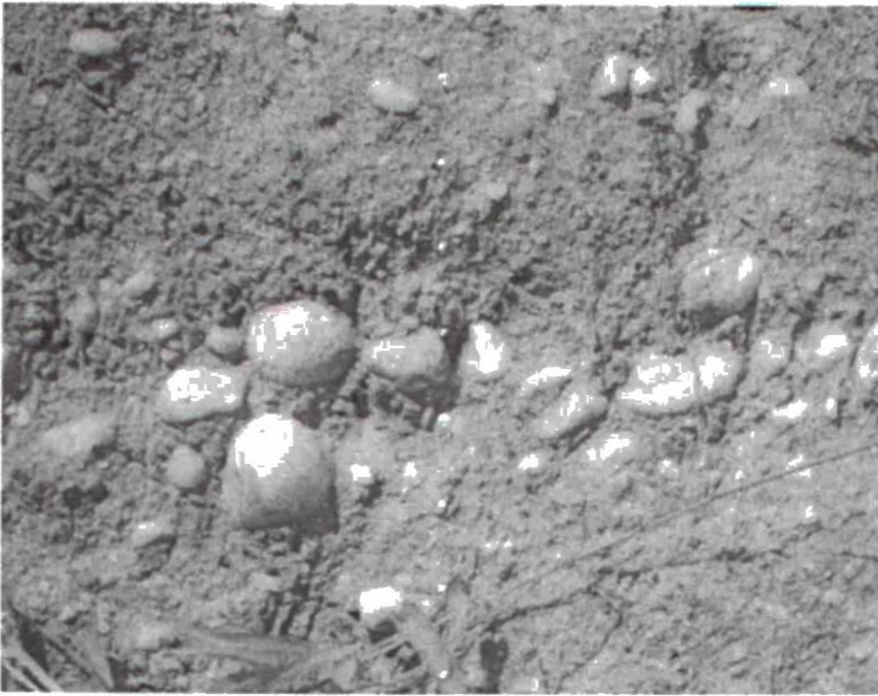
Figure 5: A gravel hummock at Leekolawewa (coordinates 7°42'N, 80°02'E), about 40m above MSL, in Northwestern Province.