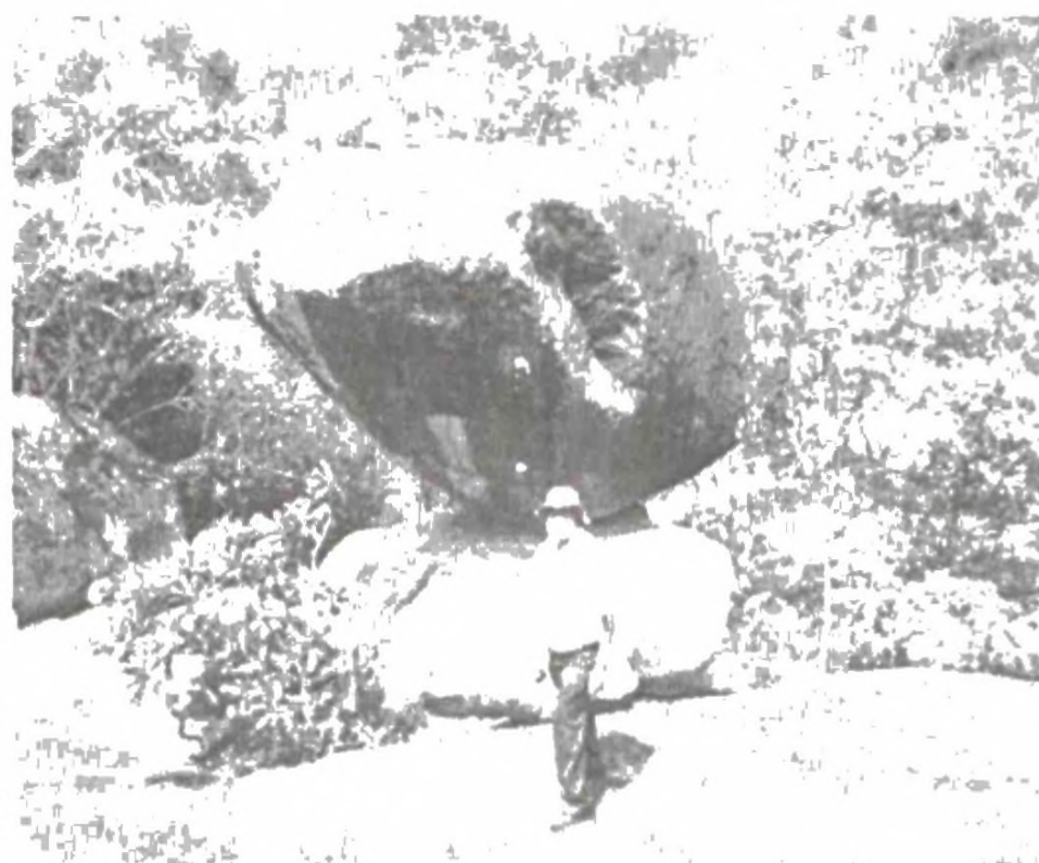
Figure 4: Erratic boulders at Nakolagane Temple site (coordinates 7°49'N, 80°19'E) both in Kurunegala District.

Between Kaduwela and Hanwella on the Kelani Ganga (Western Province), for example, a high-level gravel known as the “Malwana formation” is present at 16m above the present river level (28m above MSL); a lower gravel, the Ranale formation, is found at 6.5m above the present river level (23m above MSL; Photograph 6). The Malwana formation contains beds of well rounded, coarse quartz pebbles embedded in a matrix of laterite separated from each other by pebble-free layers of laterite. Remnants of this formation are seen capping the ridge that runs parallel with the river in Ranale and Nawagamuwa villages on the left bank of the Kelani Ganga (river), and at Mapitigama, Weelgama, Thittapattara, and Wiyalananda villages on the right bank of the same river (Cooray 1984).