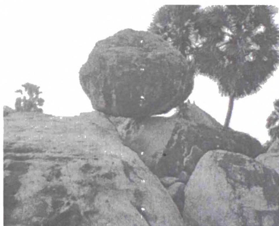
Figure 2: Showing erratic boulders at Uraniya (Pottuvil) Lagoon (coordinates 6°54'N, 81°50'E), 3m above MSL, East coast.

Erratic boulders at Kadigawa (coordinates 7°42'N and 80°00'E) and Kadigawa Temple area (coordinates 7°43'N and 80°00'E) in the Kurunegala District Northwestern Province are located on the Second Planated Surface. The area is 35 - 40m above the present MSL. Erratic boulders at Nakolagane Temple site (coordinates 7°48'N and 80°18'E, Photograph 4) and erratic boulders at Viharagala Temple site (coordinates 7°46'N and 80°28'E, Figure3) in the Kurunegala District, Northwestern Province are located above 120 to 200m MSL. The boulders of the Northwestern Province are derived from the rocks of Highland and Wannu Complexes. The Wannu Complex is composed mainly of quartzites, calc-silicate gneisses, cordierite gneisses, garnet-sillimanite gneisses, garnet-biotite gneisses, quartzofeldspathic gneisses, metagranites (including pink granites), granitoid gneisses, charnockites, meta-diorite, amphibolites, meta-gabbros, migmatites, monzo-diorite and pegmatites.