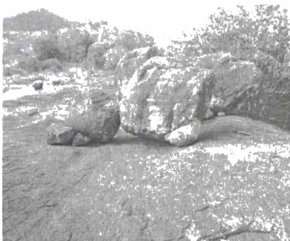
Figure 3: Erratic boulders at Viharagala Temple site (coordinates 7°46'N, 80°28'E).

areas and ferruginized, indurated gravel bearing deposits exposed at Erunwela, Muttibendivila, Pallama, Metiyagane and (in the subsurface of hummocks throughout the lower plains in the northwest (Wayland 1919, Coates 1935, Deraniyagala 1958, Cooray 1963 and 1984). The original transported materials were converted to iron-rich brown and reddish brown earth embedded with well rounded quartz gravel to pebble size are found in a hummocky area at Leekolawewa in the Kurunegala District (Photograph 5). The sizes of the well rounded and oval shaped pebbles and cobbles vary from 2.0 cm to 8.0-10 cm. This author believes that these sediments represent weather-worn outwash plain deposits produced at several stages during the glacial history.