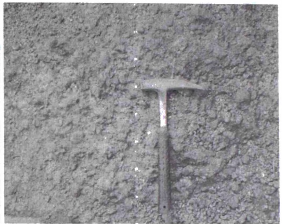
Figure 6: Ranale Gravel Deposit (coordinates 6°55'N, 80° 02'E), 22m above MSL in Western Province (as stream fed deposits)