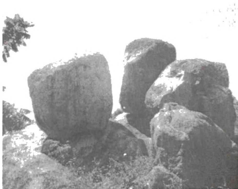
Figure 1: Showing erratic boulders at Tennamavadi (coordinates 8°58'N, 80°58'E), about 1.5 km southwest of Kokkilai Lagoon mouth, 15 -20m above MSL in Northeast coast.

ice-rafting. Ice-rafted debris or ice-rafted deposits and stream feddeposits were deposited onto the bottom of the water body, for example, onto a river bed or an ocean floor. Erratic boulders at Tennamavadi are located at coordinates 8°58'N and 80°58'E in Sri Lanka's Northeastern Coastal Zone very close to the present coast. The locality is about 15-20m above MSL and 1.5 km southwest of Kokkilai Lagoon mouth, (Figure 1). Colour and mineral composition indicate that the rocks are derived from the Highland Complex rocks. They are mainly quartzite, marbles, garnet-sillimanite-schist and charnockitic gneisses. The erratic boulders at Valaichchenai Lagoon (coordinates 7°56'N, 81°33'E), and Uraniya (Pottuvil) Lagoon (coordinates 6°53'N, 81°50'E) are about 2.0m - 4.0m above MSL (Figure2). The lithology of these boulders being composed of a heterogeneous group of gneisses, migmatites and granites with scattered sedimentary bands confirm the source to be Highland Complex rocks (Cooray 1984). The erratics exhibit rounded, oval and elongated shapes ranging in from pebbles to large boulders hundreds to thousands of metric tons in weight. These appear to have been dropped on rock outcrops or on the ground by melting glaciers moving in a northeasterly direction.