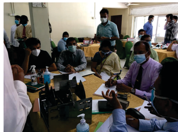
Figure 2: Discussions of the expert panel