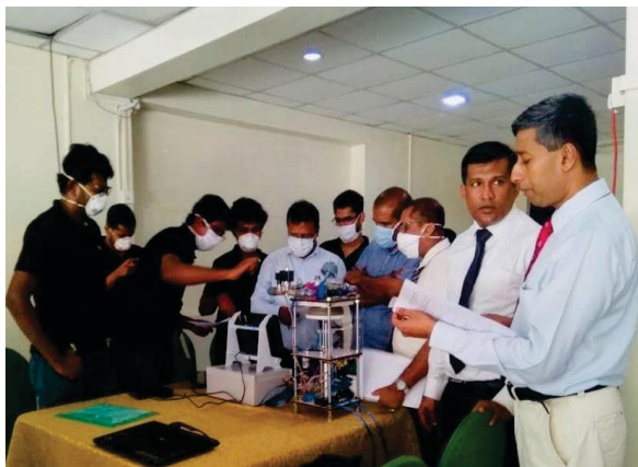
Figure 3: Mechanical ventilator produced by 'Vega Innovations' at the stage of assessing minimum requirements

Among the innovations which were showcased, several noteworthy products were observed. Mechanical ventilators and intensive care unit (ICU) beds were such innovations. Four teams produced mechanical ventilators and two have reached the minimum standards of the expert committee. Both these ventilators have reached the level that they could be used in an emergency whilst one of them was developed as a transport ventilator for use in ambulances. One team of innovators produced an ICU bed considering the local requirements and it is at a stage that it could be commercially produced and exported.