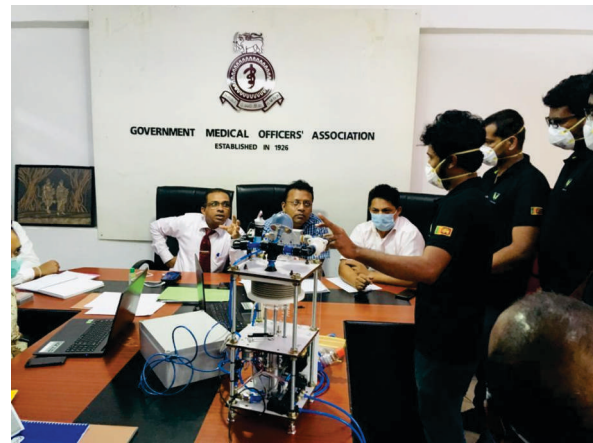
Figure 1: Mechanical ventilator produced by a group of inventors (Vega Innovations) - initial meeting

inter-sectoral collaboration amongst the diverse fields of the sciences. Those who had successfully developed their prototypes were introduced to the research and development committee. Through this exercise, it was possible to give a variety of expert opinions and technical guidance. Once improvements had been carried out and the innovations had been standardized, those that had reached the relevant standards were introduced to health care facilities based on the need during the crisis. This cycle of selection, advice and guidance, and appraisal of any innovation is to be a sustainable and continuous process.