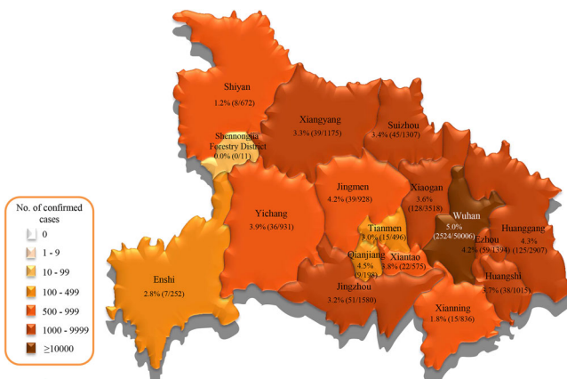
FIGURE 3 Distribution of coronavirus disease 2019 cases as of 23 March 2020 in Hubei, China. Date source: as reported by China

A retrospective study of 425 patients with SARS-CoV-2 pneumonia at the beginning of the epidemic before 22 January 2020, found that the average incubation period of the disease was 5.2 days (95% confidence interval: 4.1-7.0) and the P 95 was 12.5 days; in the early stages, the epidemic doubling time was 7.4 days, which means the number of infections doubled every 7.4 days; the R 0 was estimated to be 2.2 (which means infecting two healthy people for every sick person). 31 Additionally, the WHO assessed the R 0 of this epidemic as between 1.4 and 2.5. 7