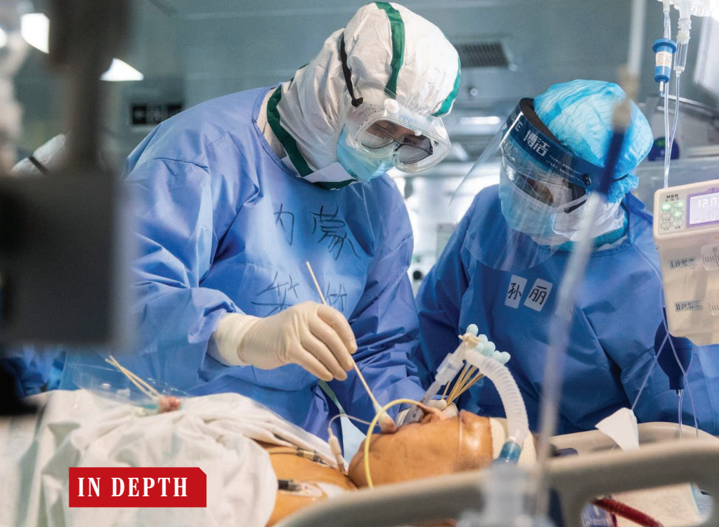
Medical staff treat a patient with the novel coronavirus this month in Wuhan, China.